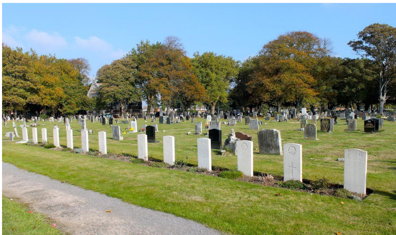
Australian War Graves in Milton Cemetery, Portsmouth