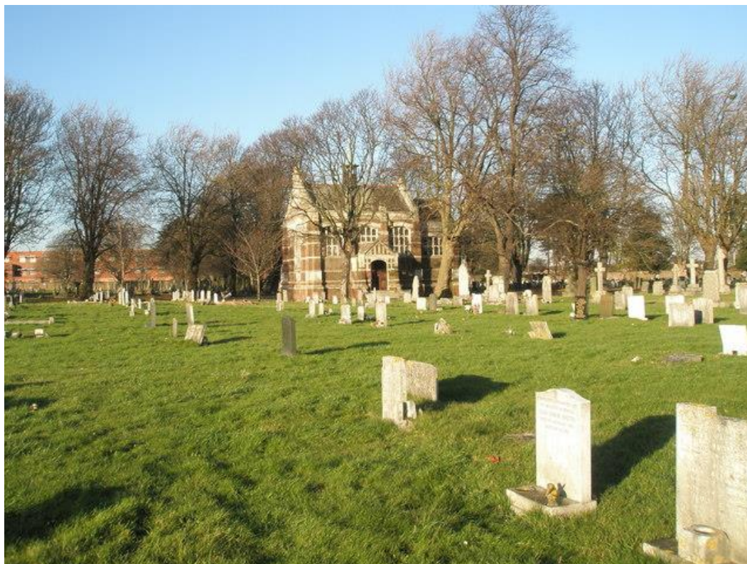
Cemetery Chapel at Milton Cemetery, Portsmouth